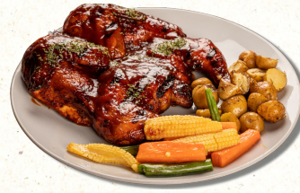
Roasted Cajun Chicken