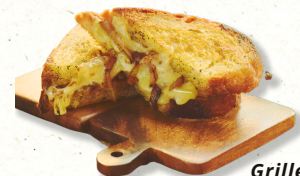
Grilled Cheese Sandwich