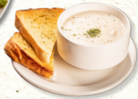
Shitake Mushroom Soup