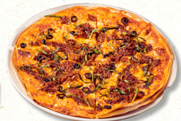
Meat Lovers Pizza

Meat Lovers P570 Pulled Pork P570 Bacon & Cheese P570 Four Cheese P460 Margherita P460