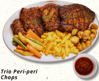
Trio Peri-peri Chops

Roasted Cajun (Whole) P270 Roasted Cajun (Half) P380 Buffalo Wings P390 Crispy Chicken Wings P380