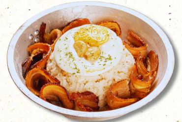
Bacon Shack Bowl

Beef Teriyaki P290 Chicken Teriyaki P280 Adobo Flakes P275 Bacon Bowl P275 Chori Bowl P275