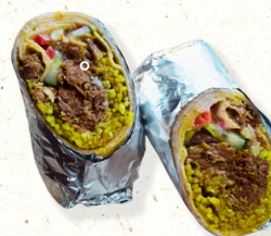
Pulled Pork Burrito

Beef Burrito P280 Beef & Shrimp Burrito P300 Chicken Burrito P280 Pulled Pork Burrito P270